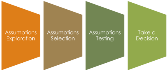
Figure 2. ESTD Method of Decision-Making Go / No-Go

As explained in the opening that in addition to the frequent deterioration of a business and also can occur often the condition of the absence of execution of a business, it is necessary to research how to collect information, process it and produce the decision of Go / No-Go quickly, so as not to waste time, energy and resources, especially in the field of software development.