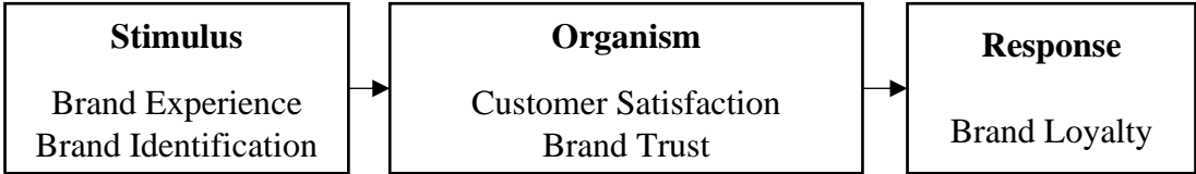
Figure 1. Stimulus Organism Response (SOR) model examine in this study