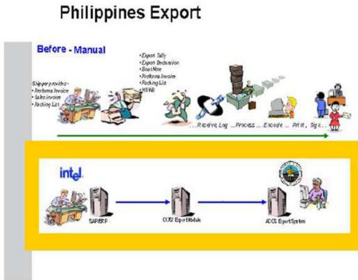
Figure 1. Manual and electronic clearance systems (Wong, 2006)